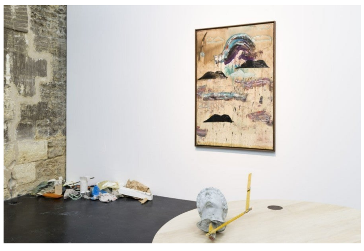
Benoît Maire, Thèbes, exhibition view (peinture de nuages, sculpture and waste on the ground), 2018. CAPC musée d'art contemporain de Bordeaux, Bordeaux, France.