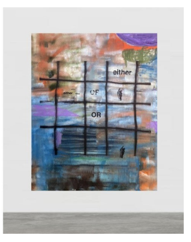
Benoît Maire, peinture logique, 200x250 cm, 2022, Rome.

In analysing Maire's approach, I am constantly caught in a bind whether to describe the conceptual and physical apparatus that generates the artwork, mimicking the artist's explanation and thus becoming a spokesperson for his sophisticated logic, or to deconstruct instead his intention and just follow my own train of thoughts. I choose to settle for a conversation between the two options.