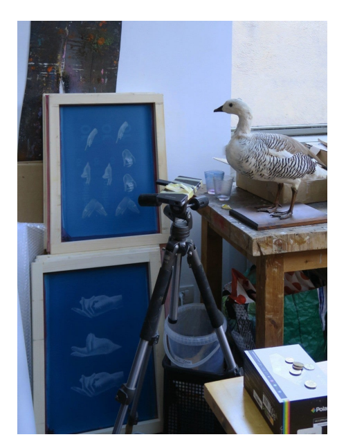
View of Benoît Maire's studio at the Villa Medici, 2022 Rome.

moments later I realise that they are being juggled horizontally by a young man who, as the end credits reveal, is the curator. To recap: the ART object falls from the philosophy tray, thus breaking the veil of the spectators' disbelief. The viewer then questions whether they witnessed the curator's unwarranted slippage or the artist's perturbation plan, and if the two actions are consequential. This is a good example of Maire's ability to construct a visual-logical proposition, directing the viewer's gaze while distilling the visual information to a selection of signs, containing in turn layers of signifiers – which of course generates more questions.