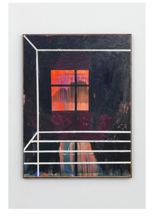
Benoît Maire, peinture de nuages, peintures logique et peinture de nuages, 2022. Acrylic spray paint and oil paint on canvas, 75x100cm, 2022, Rome.