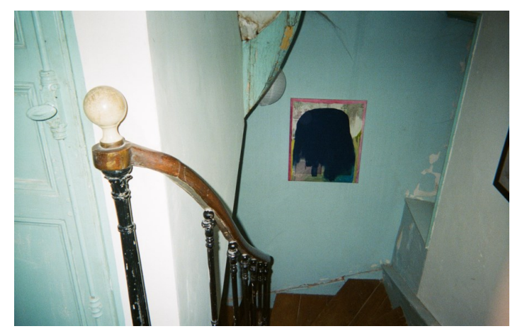
Tom Terrieu, sans titre, 2020. View of the house, Fossile Futur, Meymac, 2023. Photo: Liza Maignan. Courtesy of the artist.