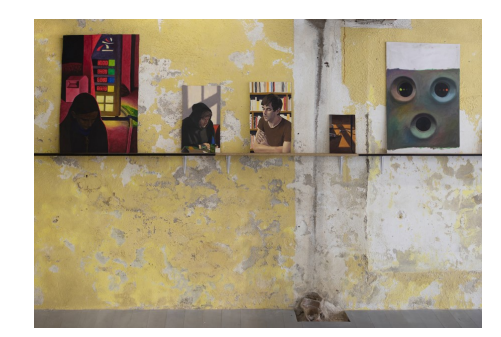
Matthieu Palud, views from the exhibition "Peintures récentes", July 24 - September 4, 2021, Cocotte, Treignac.