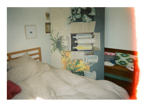
View of Olga Boudin's bedroom, Lacelle, 2023.