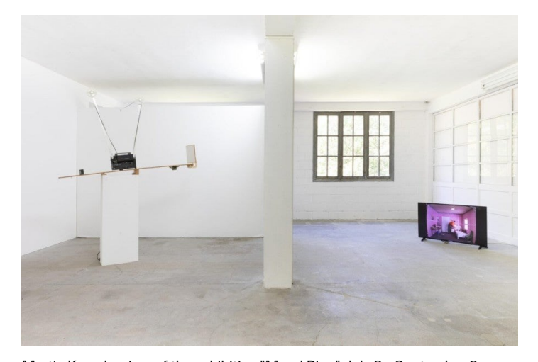
Martin Kersels, view of the exhibition "Mood Ring", July 2 - September 9, 2022, Treignac Project, Treignac.