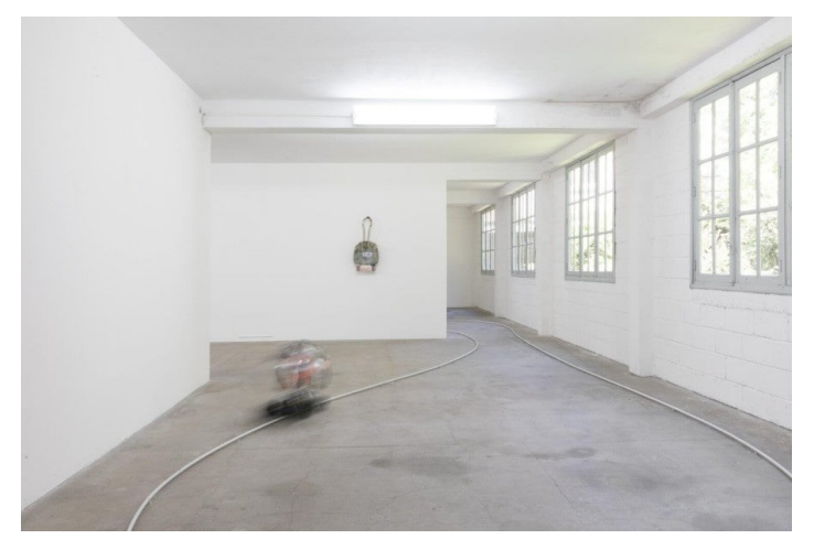
Martin Kersels, view of the exhibition "Mood Ring", July 2 - September 9, 2022, Treignac Project, Treignac.