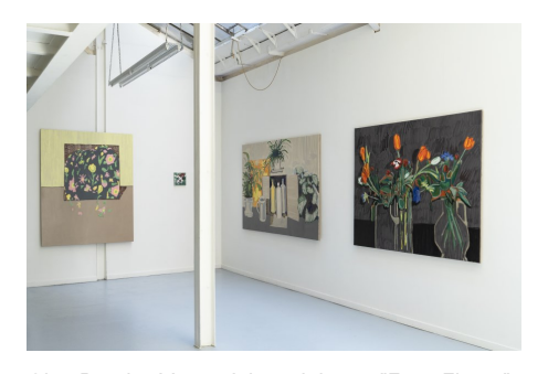
Olga Boudin, View of the exhibition "Faire Fleurs", rue du Docteur Potain, Paris, 2023.