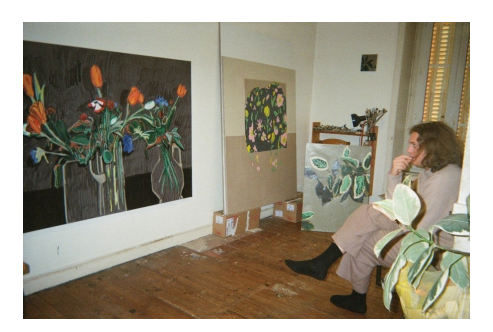
View of Olga Boudin's studio, Lacelle, 2023.