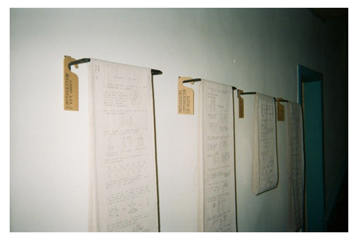
Information display designed and produced by Simon Dubedat and Léa Chaumel. View of the entrance, Fossile Futur, Meymac, 2023.