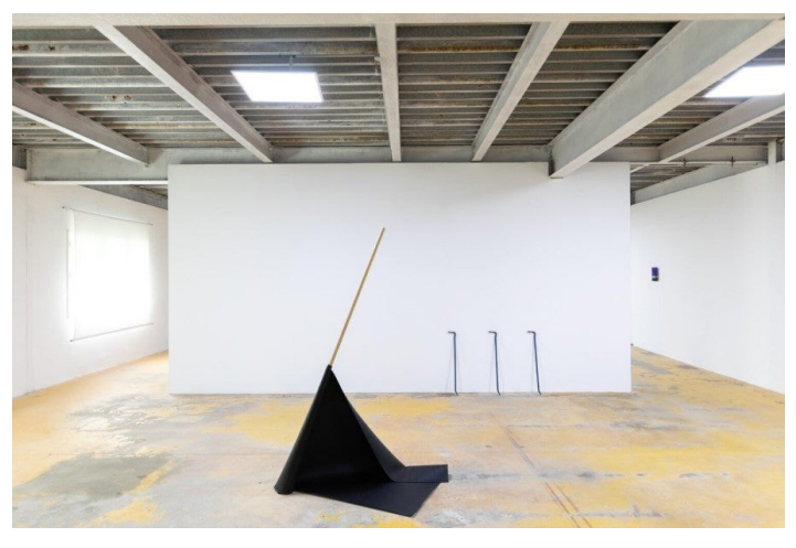
Julie Sas, view of the exhibition "OK OK K.O", July 2 - September 3, 2022, Treignac Project, Treignac.

The discovery of these artistic activities and this territory allowed Olga and Julien to consider the possibility of settling on the Plateau de Millevaches, and more precisely in the village of Lacelle, in order to continue working, to make art (or not), to think about how to live differently. Because what seems to connect each person from the Amicale mille feux, or from Fossile Futur (which was established in a nearby town a few years later) with one another, is a desire to leave something behind that does not suit them, to fulfil a need for emancipation and autonomy. That something would be an excess: an overflow of problems, unstable economic conditions, institutional integrations required for a practice to exist. A desire to cut themselves off from everything else so that they can rebuild their spaces, reconfigure their rhythms, redefine their ways of living and working, both of which are inherent to their political postures. Militant, political, and philosophical presences and activities, which have multiplied on the Plateau de Millevaches, particularly in the village of Tarnac, have also confirmed this desire for territorial anchoring, historically infused with and carried by other national or international struggles, such as in Larzac in the 1970s or the Notre-Dame-des-Landes ZAD<sup>5</sup> set up in the 2010s by objectors to the Grand Ouest airport project.