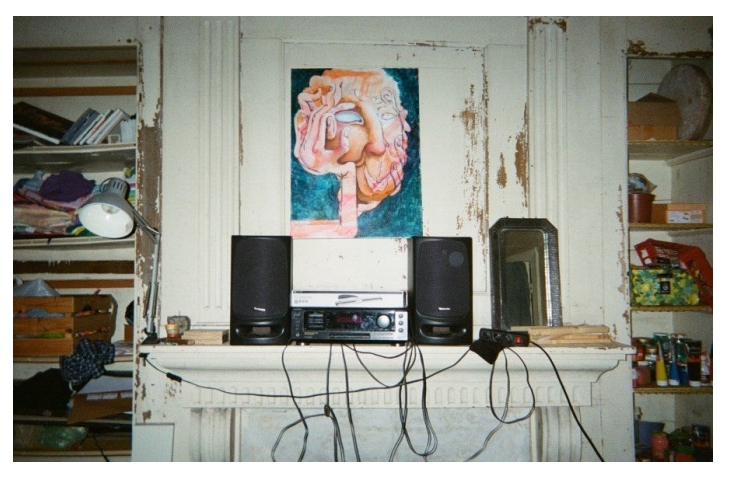
Pacôme Ricciardi, SDB (work in progress), 2023. Studio view, Fossile Futur, Meymac, 2023.